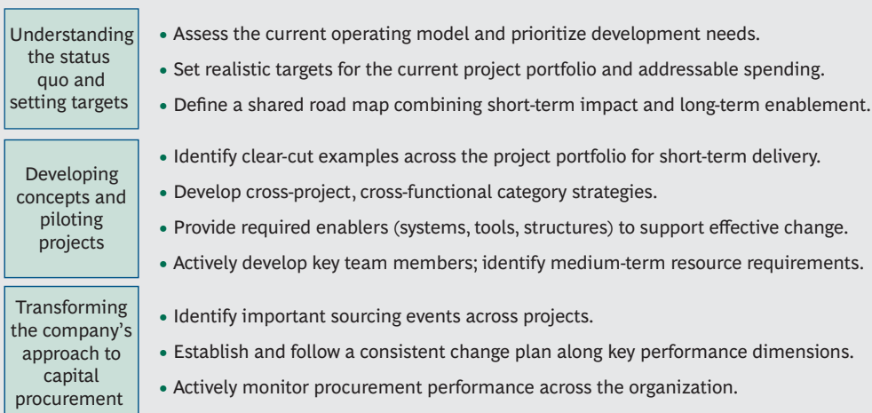
EXHIBIT 3 | Putting Key Success Factors in Place Can Transform the Procurement Function

In the case of larger procurement organizations, these changes require a coordinated cross-functional approach, involving both the engineering and project-management functions. Building the model itself will require working in stages, first assessing in detail the procurement function's current model, and then developing a multiyear plan for moving to the new model. (See Exhibit 3.)