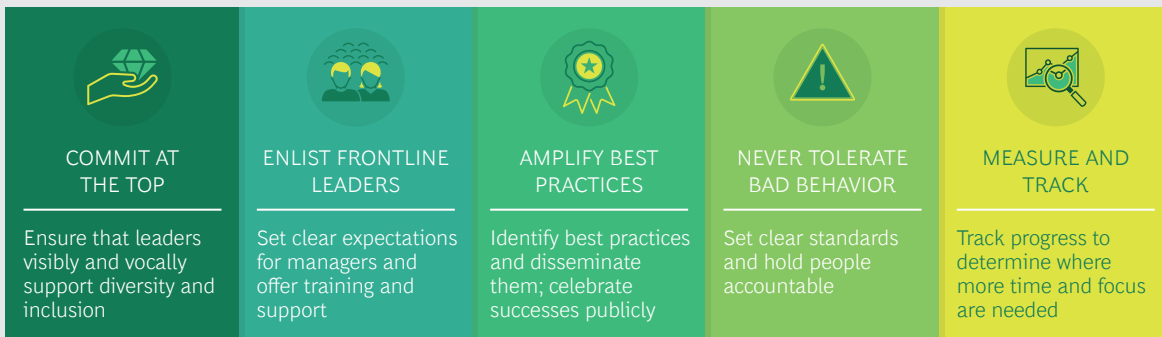
EXHIBIT 3 | To Become More Inclusive, a Company Must Focus on Five Imperatives