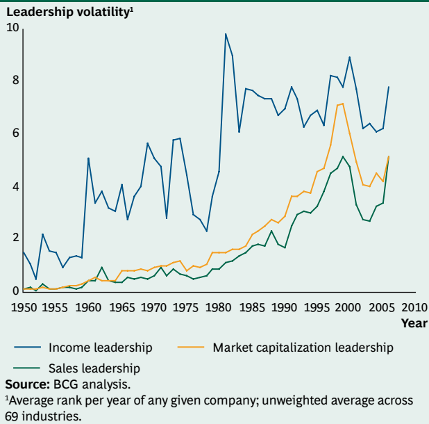
Exhibit 1. Market Positions Have Become Increasingly Volatile over Time

ing increasingly limited in their ability to address these rapidly evolving trends, which have resulted in extremely fluid business systems.