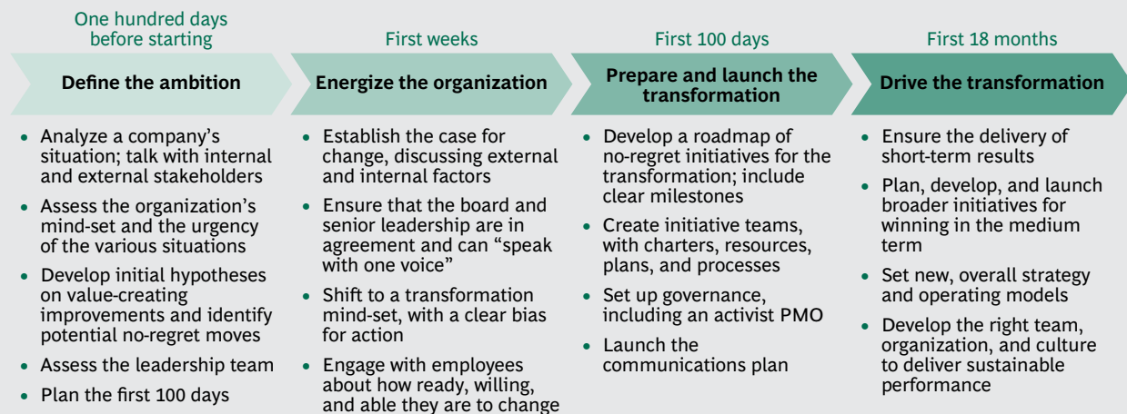
EXHIBIT 3 | The Transformation Process for New CEOs Has Four Stages