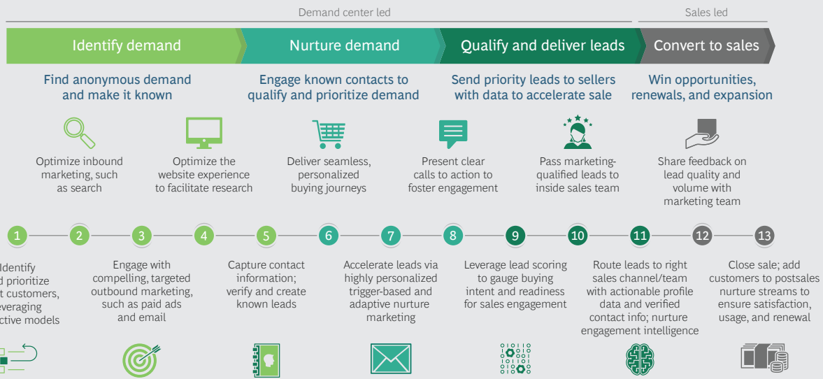
EXHIBIT 3 | Demand Centers Shape the Core Phases of Customer Engagement